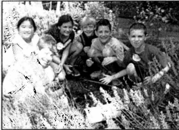
Tending to the kitchen herb garden on the historic Kissam property.